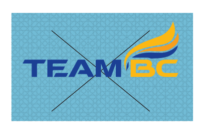
Do not print the logo on a patterned or distracting background.